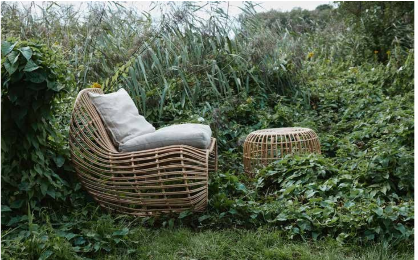
Casual meets chic in wicker look lounge furniture.