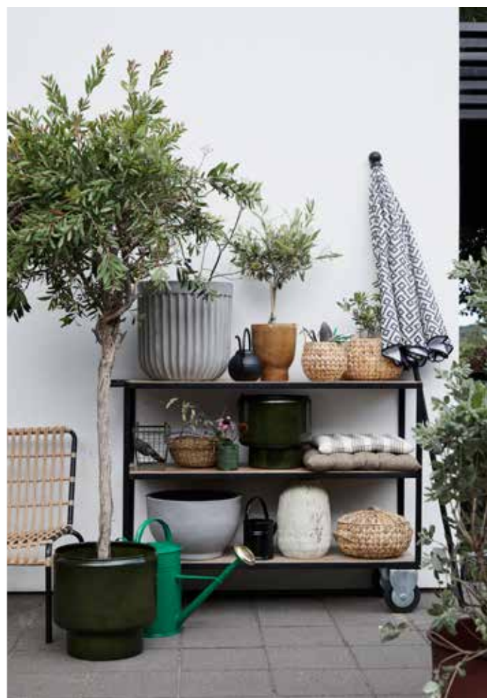
Make the most of any outdoor space with light and flexible designs.