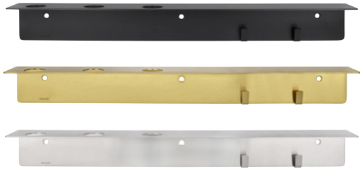
Bottle hanger with hooks Brushed black item no. 308580105 Brushed brass item no. 308580106 Brushed silver item no. 308580104