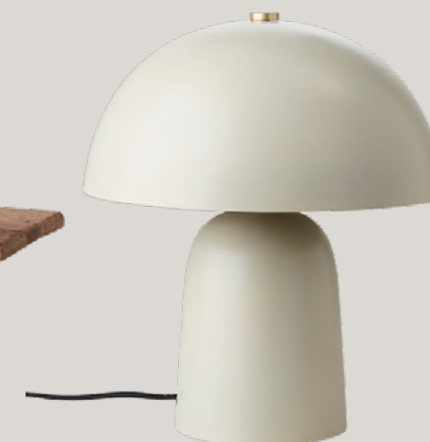
FUNGI Table lamp