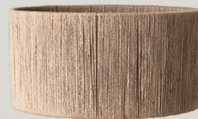
JULLAN Lamp shade