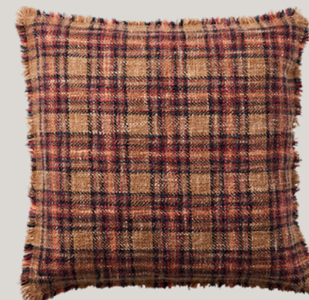
TAGE Cushion cover