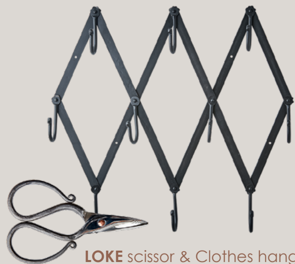
LOKE scissor & Clothes hanger