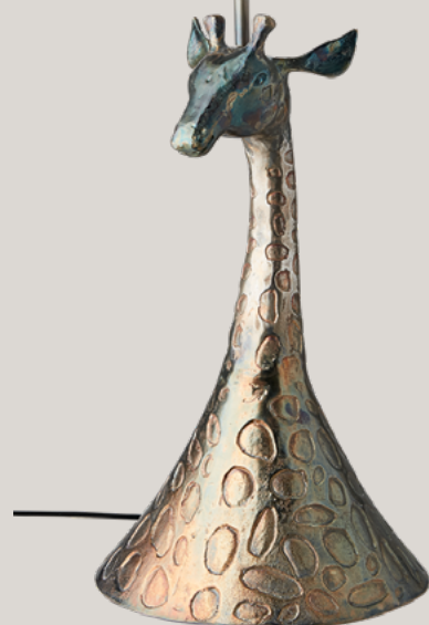
RAFFE Lamp base