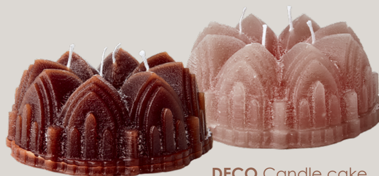
DECO Candle cake