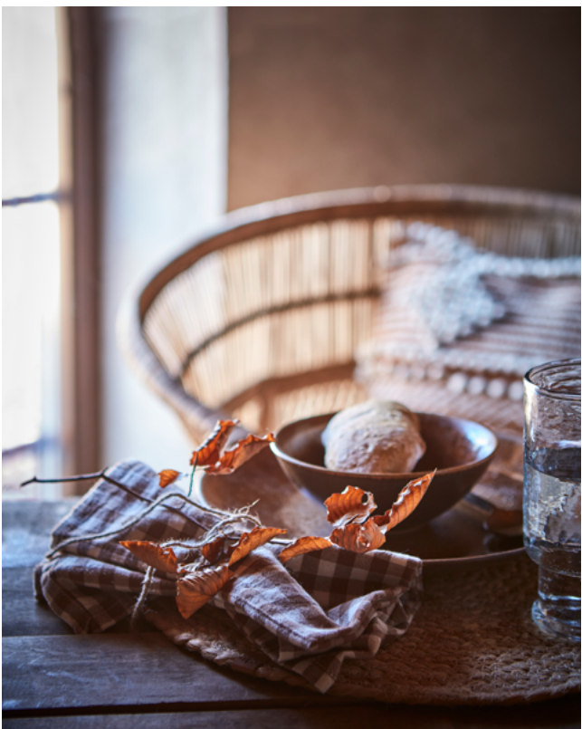
TABLE TEXTILES WITH LAID-BACK ELEGANCE

Tablecloths, towels and napkins made of lovely, soft crinkled cotton in earthy colour tones.