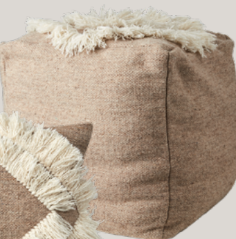
MINNA Pouf & Cushion cover