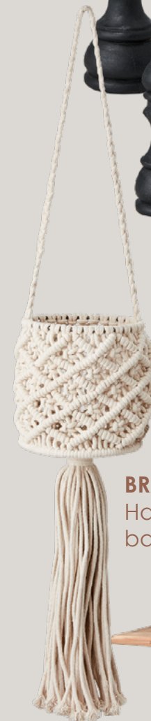
BRAID Hanging basket

Check out this selection of new arrivals for the 2023 Autumn/Winter season.