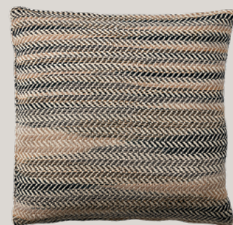
PELLE Cushion cover