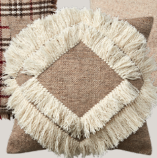
TAGE Cushion cover