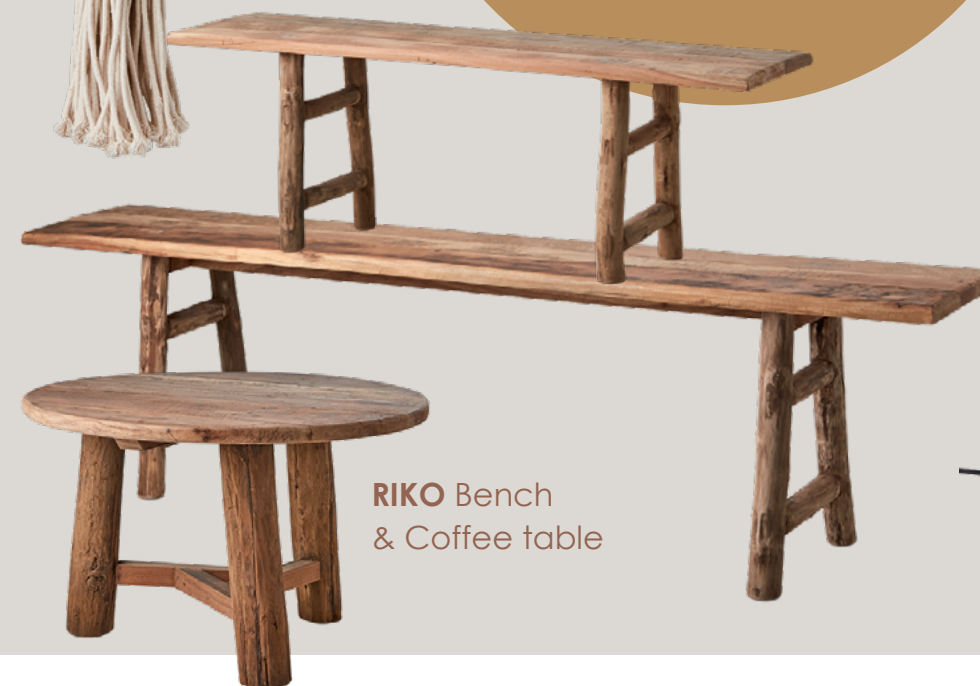
RIKO Bench & Coffee table