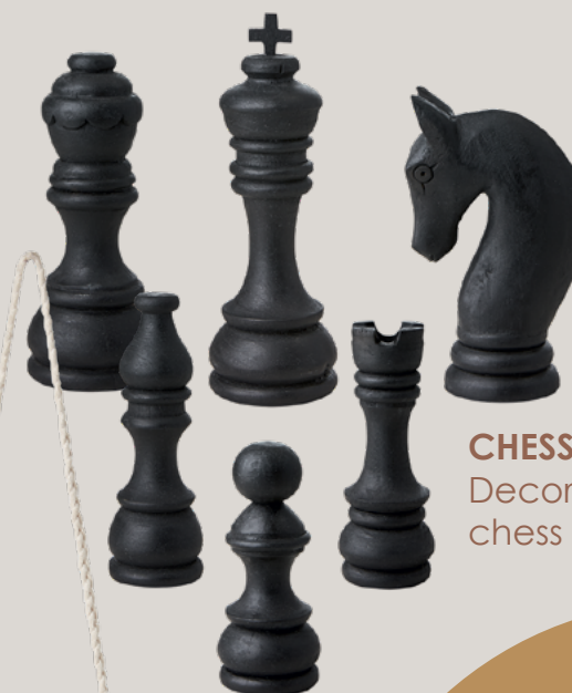
CHESS Decorative chess piece